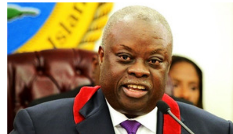
Governor Kenneth Mapp