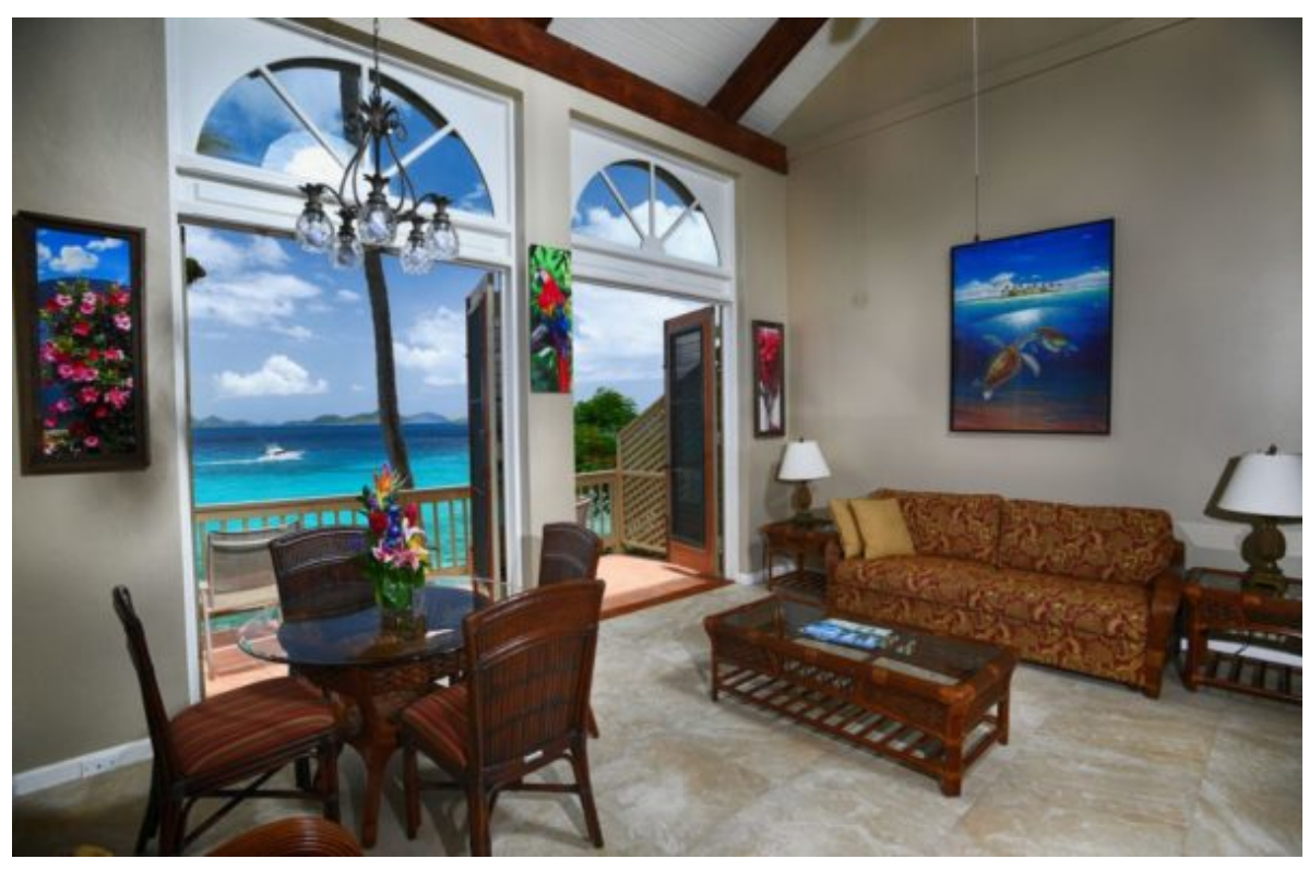
Picture yourself waking up to this! (Units are individually owned, so décor may vary).

Oh, and after you enjoy a first peaceful evening at your villa and an amazing night's rest in your king sized bed, you can head straight to the beach the next morning! The villas at Gallows Point all include beach chairs, coolers and beach towels...So, grab your snorkel first thing in the morning and head to the North Shore!