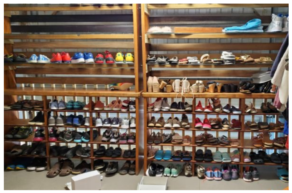
A WALL of shoes for sale in the newly renovated space upstairs. They are still organizing but the new boutique will be ready very soon.

The little island thrift shop that could just re-opened this week after being closed for an expansion into the upstairs of the main warehouse space. With stairs built to code now installed and the upstairs renovated, they now house a fully functional new-to-you clothing boutique!