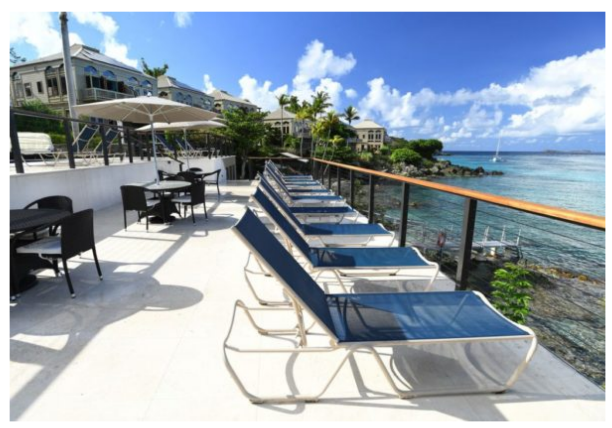
Enter to Win and picture yourself HERE!

If you haven't already done so, take a look at the full prize package because it IS expansive! But, today, I'm going to go into a bit of detail on the amazing accommodations the lucky winner (it could be YOU!) of this contest will get to indulge in for a full week! Oh, did I mention that last year's winner only bought ONE $50 ticket? That's right, one of you out there could be the recipient of an all expenses paid trip to St. John for JUST $50!