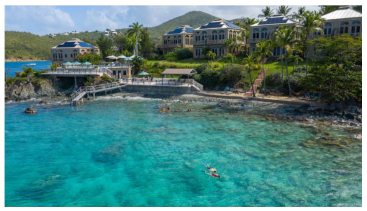
A seven night stay at Gallow's Point Resort is just the beginning of this amazing prize package!

If you are not familiar with Gallows Point Resort, let me just tell you that it is the ultimate blend of luxury, accessibility and serenity. Located on Gallows Point, between Frank Bay and Cruz Bay with on-site parking, guests at Gallows Point Resort never have to worry about the lack of parking in Cruz Bay. But, with sea and snorkel access, a private pool, an elegant restaurant, a workout facility and convenience store/coffee shop on site and dozens of quiet outdoor areas to relax, you may never leave the property!