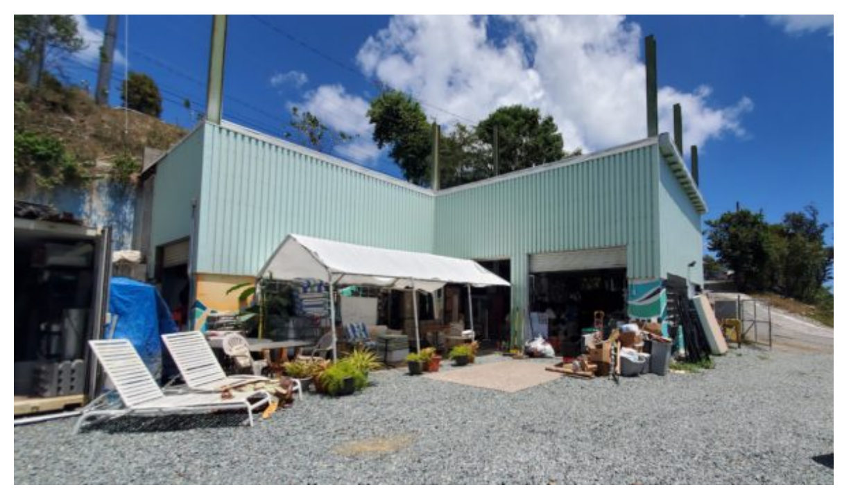
My Happy Place! Full of treasures to be found.

I pulled into the gravel parking lot, lined at its edges with a recycling operation in the back, several shipping containers housing departments such as clothing, tools, building materials, etc., and a warehouse type space absolutely filled with treasures to behold!