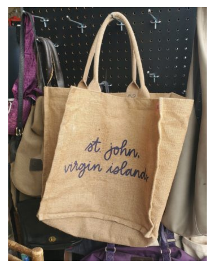
Souvenir shopping on the cheap!

Now, granted, it is the thrill of the hunt and you never know if you might find what you are looking for. But, if you're lucky, you might stumble upon exactly what you need.