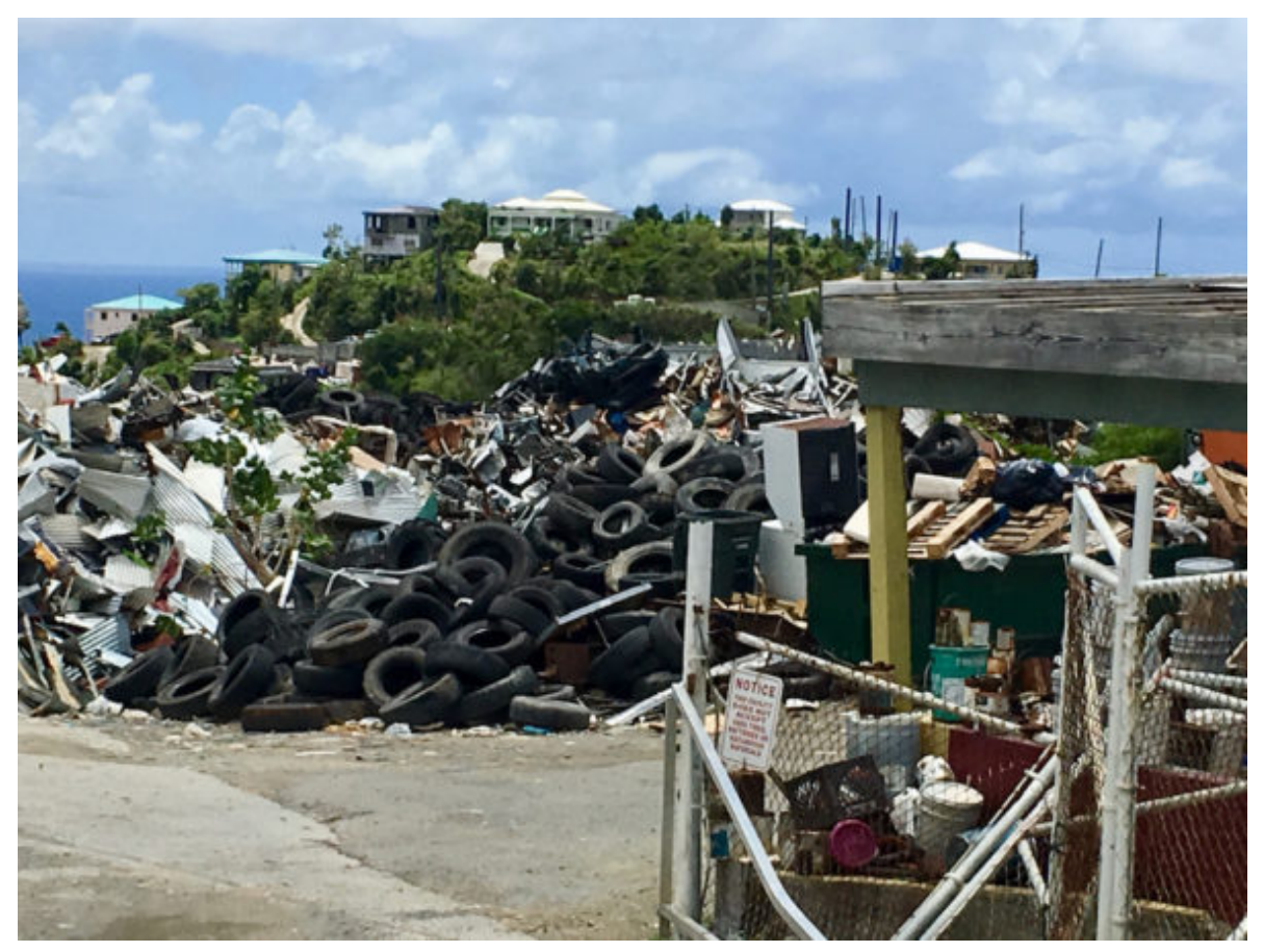
The St. John Dump at Susannaberg Transfer Station is just next door to the ReSource Depot

peoples' treasures and successfully re-routed the waste of roughly 450 people from our landfills. That's roughly 10% of the entire population of St. John...their trash just POOF! Vanishing from our carbon footprint. JUST WOW!