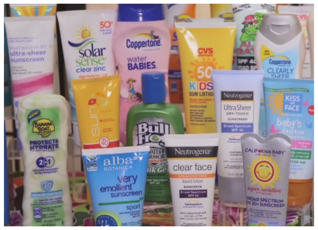
From DLCA's Facebook Page: DLCA IS ENFORCING SUNSCREEN LAW TO PROTECT MARINE ECOSYSTEM, INCLUDING CORAL REEFS AND ITS INHABITANTS ON EARTH DAY

Alas, our government here had their hands a bit full and, instead of the planned enforcement of this bill, they found themselves for the next two years navigating the unknown waters of a worldwide pandemic. Instead of checking for these, now illegal, sunscreens at the airport, they were checking COVID tests and then green codes. And, all the while, Island Green and Harith have been fighting the uphill battle of spreading awareness and engaging the government for the eventual enforcement of this law. For TWO years. But, today, DLCA kicks off a territorial island sweep called "Operation Illegal Sunscreen" to educate before they regulate and to ensure that retailers in the territory no longer carry sunscreens with the 'Toxic 3 Os' of oxybenzone, octinoxate and octocrylene.