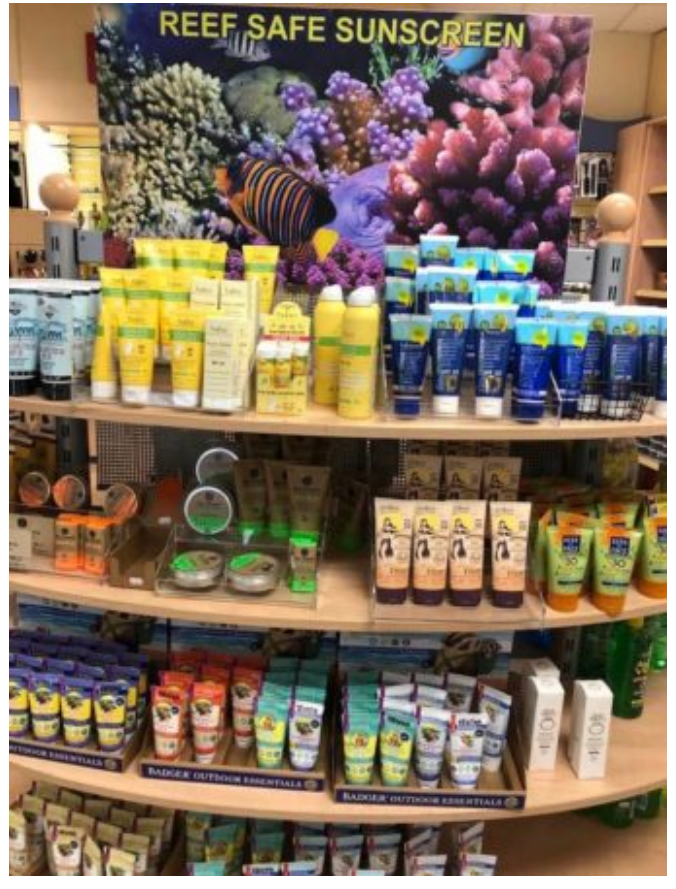
Chelsea Drugstore has an incredible selection of Reef Safe Sunscreen.

Oh, and we can all help support these efforts...If you see illegal sunscreen on the shelves of a retailer in the USVI, call DLCA on 340.713.3522 or 340.725.5129 or email at consumerawareness@dlca.vi.gov.