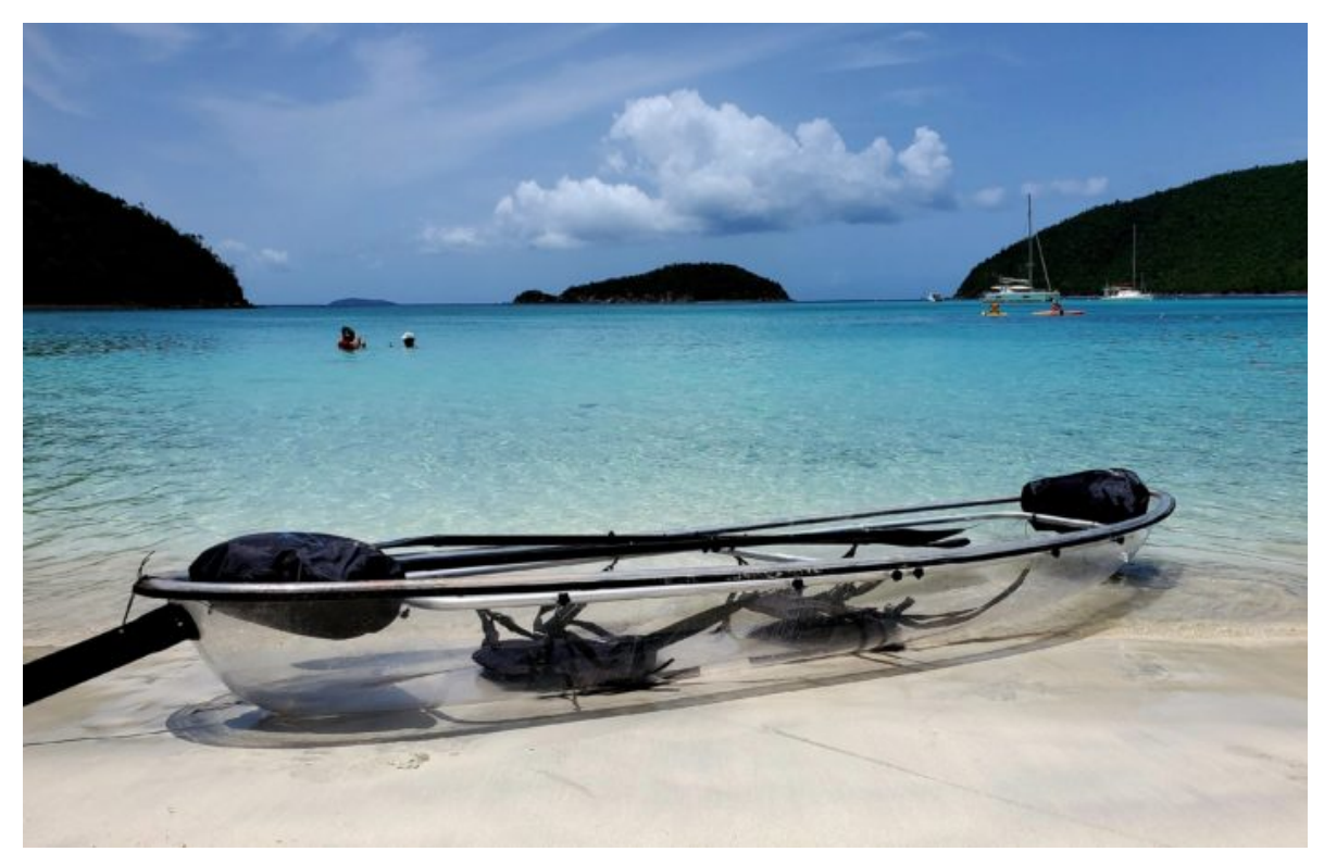
Paddle about amongst the sea turtles at Maho Bay!

If you aren't up on your Reef Safe Sunscreen shopping skills, don't worry. The winner of this amazing escape will also receive a supply of Caribbean Sol, an exceptional coral-safe mineral sunscreen that is compliant with the USVI's ban on sunscreen containing the "Toxic 3 Os" of oxybenzone, octinoxate & octocrylene.