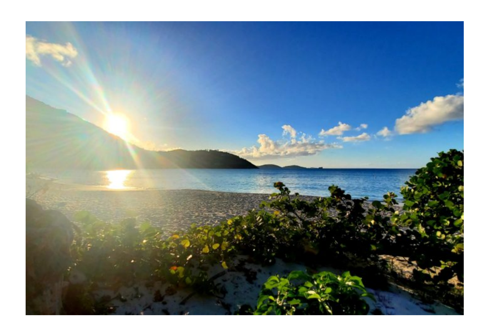
Enter to Win an Escape to Love City: "Operation Illegal Sunscreen" Starts TODAY!