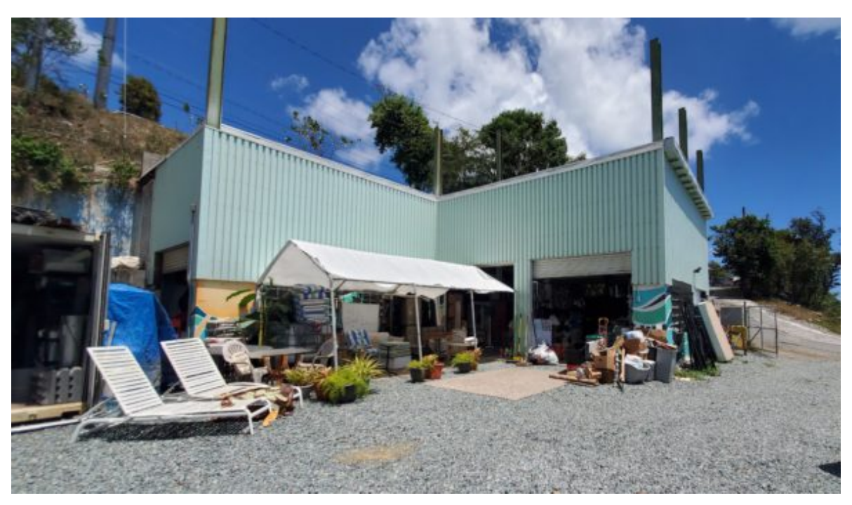
Get a personal behind the scenes tour of Island Green Living's Resource Depot

Well, what are you waiting for? Head over to the Island Green Living Earth Month Fundraiser and ENTER TO WIN your Escape to Love City today! If you are looking for a good way to celebrate Earth Day, this is it. It is an incredibly easy way to support sustainability efforts on our favorite island and, you just might find yourself here for an all expenses paid trip in the near future by loving on Mother Earth a little bit today. Last year's winner only purchased ONE $50 ticket in exchange for a week of bliss in Love City!