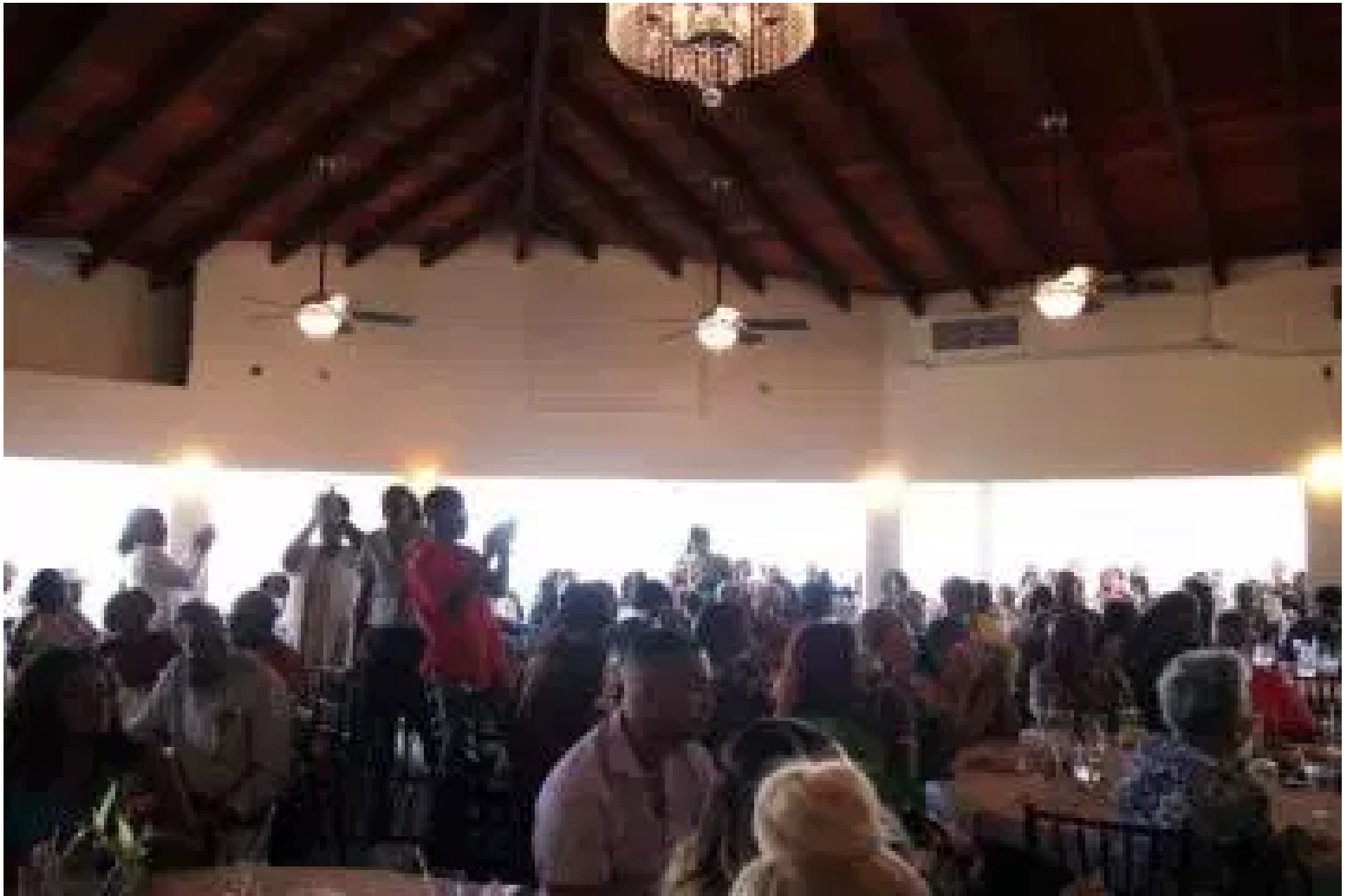
AT VIFREEP · BREAKING NEWS · BUSINESS NEWS · COMMUNITY AFFAIRS · EDUCATION NEWS · ST. THOMAS NEWS AT LEAST 170 PEOPLE ATTEND SENATOR BLYDEN'S 5TH ANNUAL SCHOLARSHIP BREAKFAST