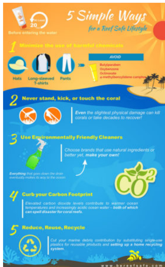
Five simple ways to protect the Marine Life!

I know, I know, there are a ton of options out there but there are also a ton of great resources for you to read in order to find the sunscreen that's best for you, and the reefs. Here are a few places to start: