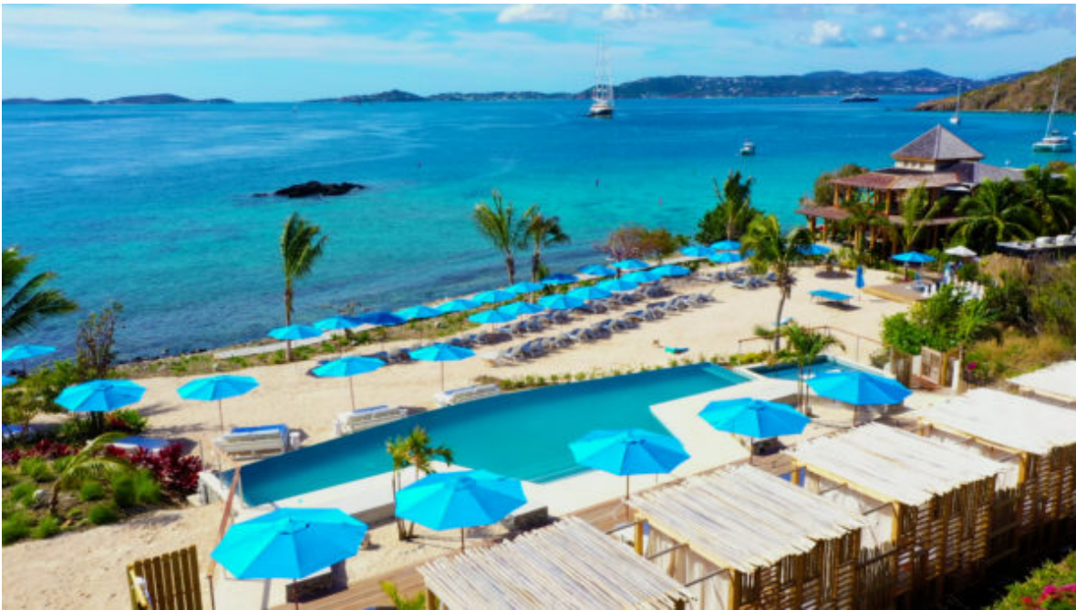
Spend a bucket list day at Lovango in a poolside cabana!

Island Green Living Association launched a fundraiser this month that will give two people the opportunity to stay at Gallows Point in Cruz Bay for seven nights with round trip airfare, dining vouchers, boat days and sunset sails and a cabana day at Lovango Beach Club + Resort!