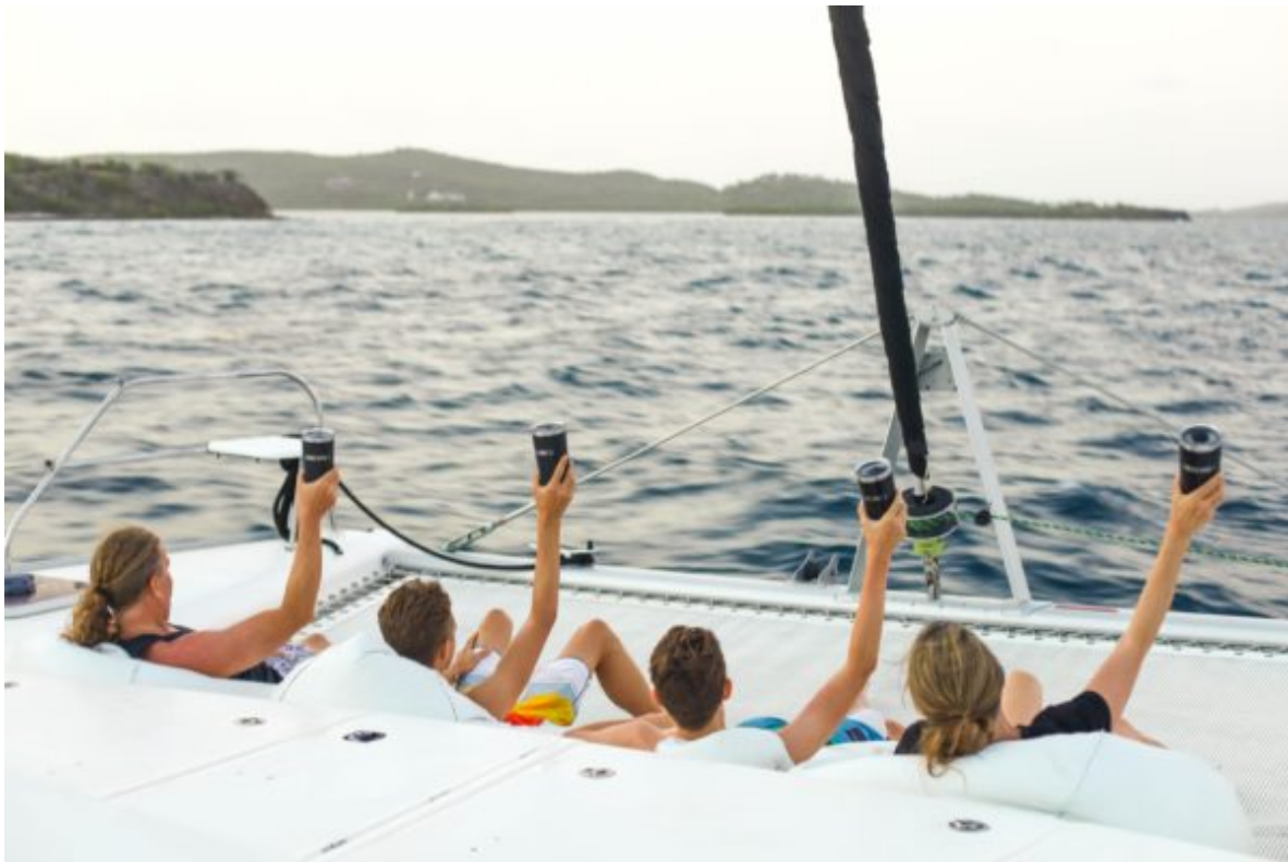
Cocktails in Paradise