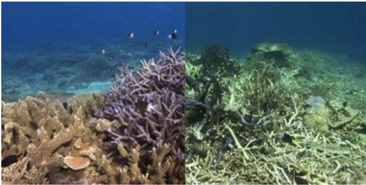
Healthy Coral to the left, Unhealthy Coral to the right.

Additionally, avoid applying bug spray, perfumes, lotions, hairspray, etc., prior to entering the pristine waters of the Virgin Islands. Many of the products we use on our skin and hair contain chemicals that are not so great for the sea life and coral reefs! Hop in the shower for a rinse off before grabbing your reef safe sunscreen and hitting the beach!