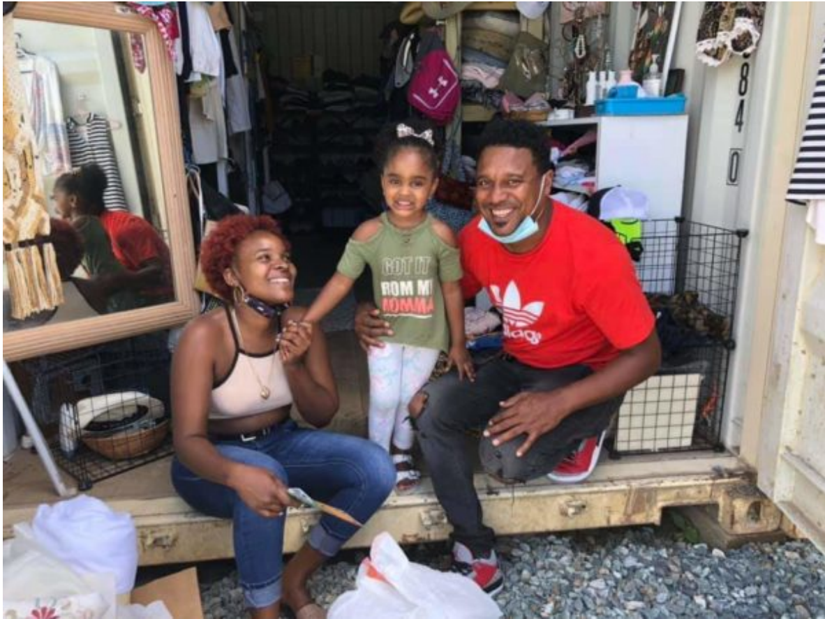
Happy Shoppers at the ReSource Depot

Gifft Hill and turn your trash into another person's treasure! And, everything sold at the Island Green thrift store directly funds the organization and their very necessary programs geared towards sustainability and environmental awareness and education on St.John.