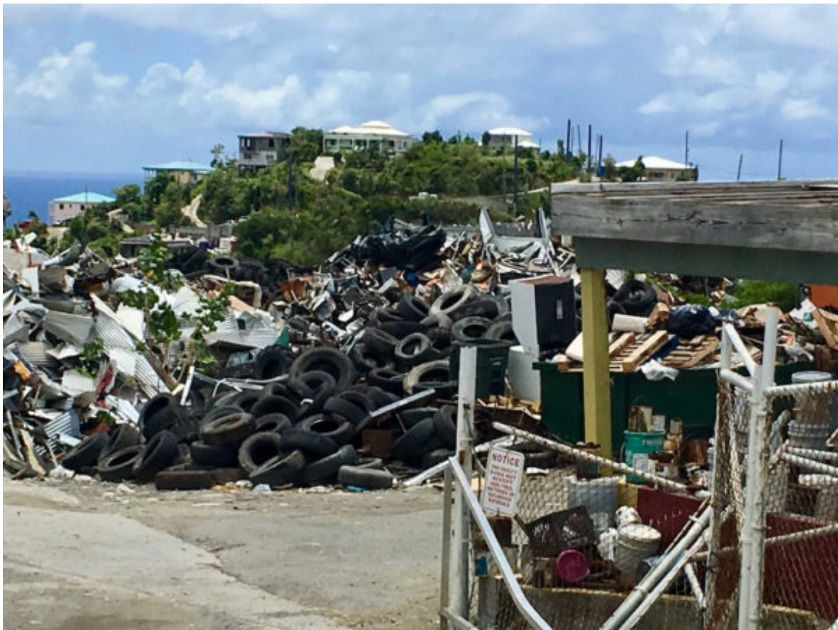
Susannaberg Transfer Station

Island Green Living Association has a beautiful solution to this problem! The ReSource Depot is St. John’s one and only second hand store. Now, instead of taking your lightly used items to the dump, you can drop them off with the crew at the ReSource Depot on