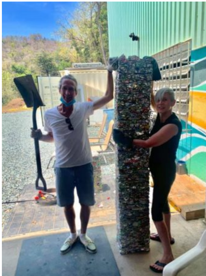
Can Crushing Volunteers....Hard at work and having fun!