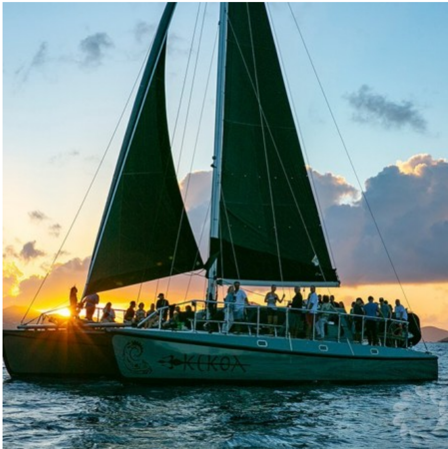
Kekoa sunset sail