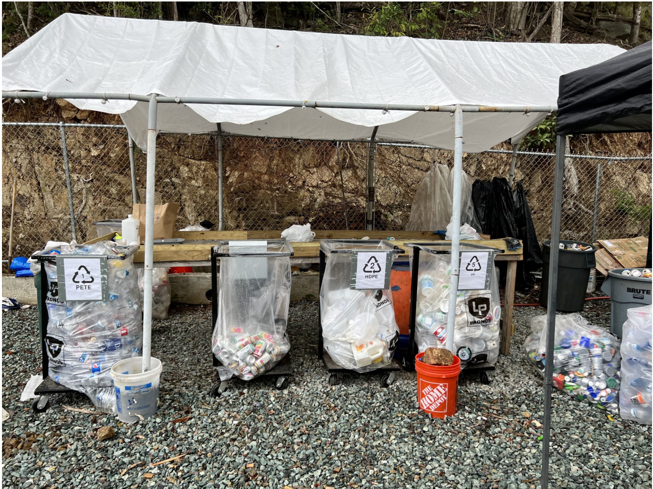
Three types of plastics –#1, #2, and #5 – are now being collected at the ReSource Depot.

The Ocean-Bound Plastics Recycling Program is a partnership between PADNOS, a recycling company based in the Midwest, and Island Green. PADNOS is also buying the aluminum cans collected at the ReSource Depot.