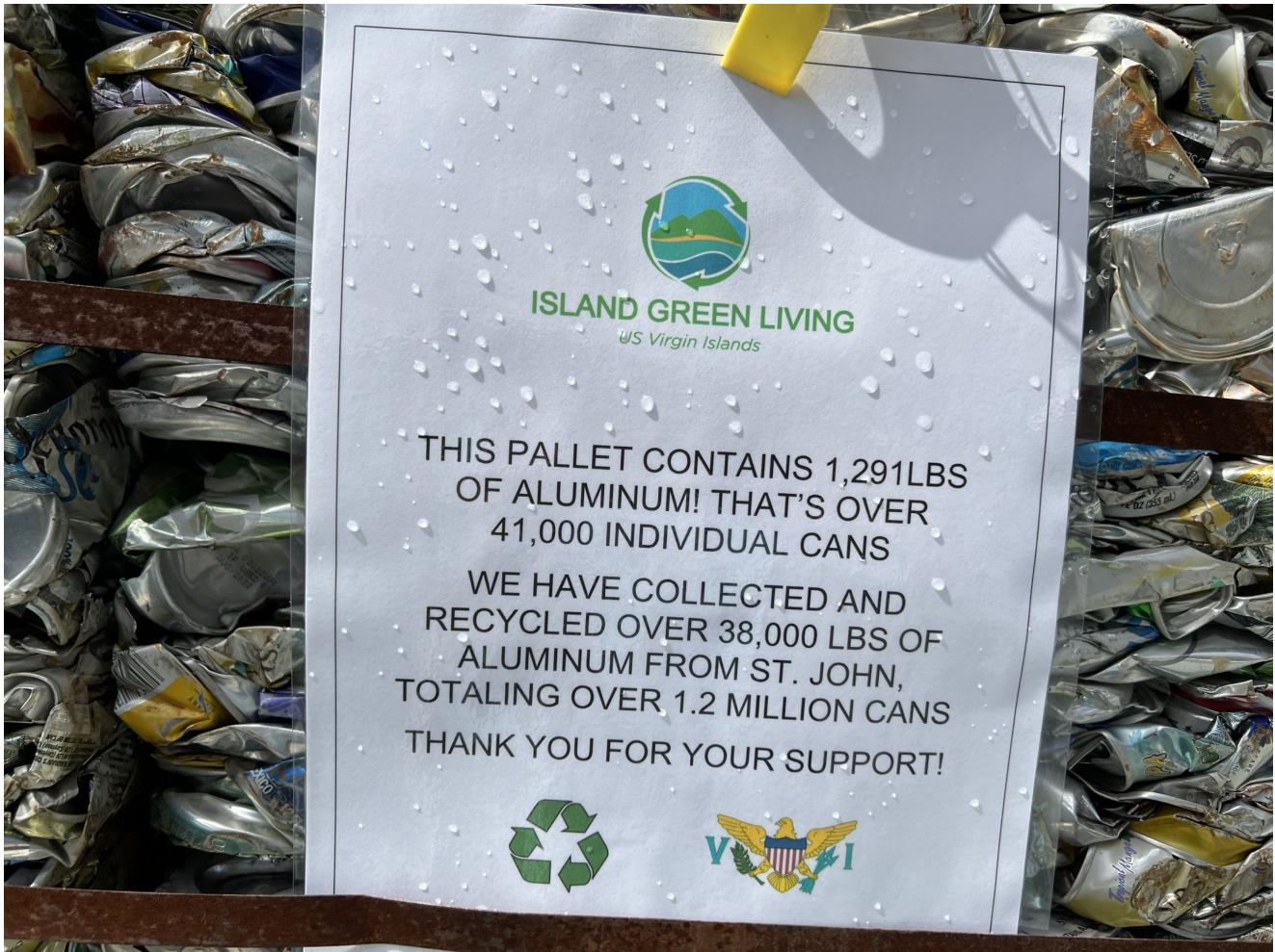
A sign proclaims the number of cans recycled since Island Green began.