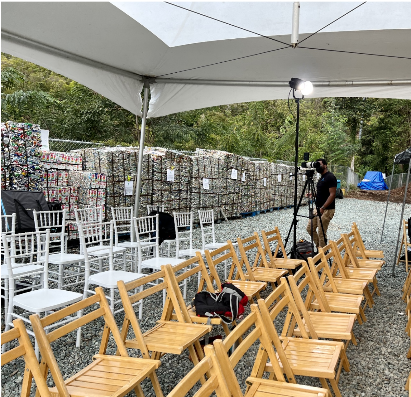
Bales of aluminum cans line the ReSource Depot's staging area prior to the ceremony.

The Resource Depot, best known for its aluminum can recycling program, is now collecting three types of plastics – commonly used for containers for water, milk, soft drinks, food, and cleansers – and processing them for recycling off-island.