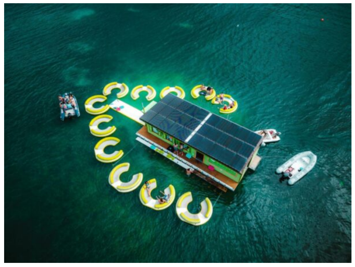
The infamous TACO BOAT>>Lime Out!