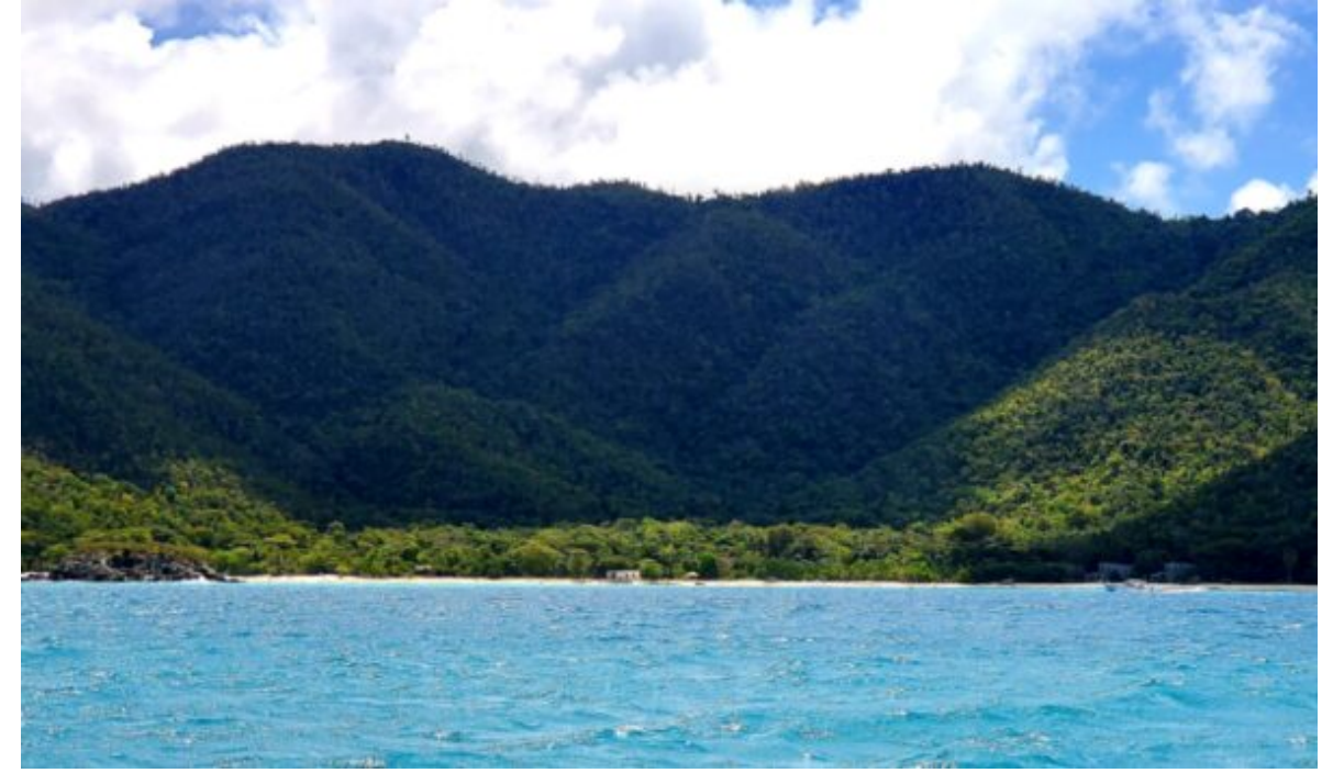
Cinnamon from the water

In 2004, the Island Green Building Association was formed with the mandate to promote green building and sustainable development. But, seeing a need to address the plethora of environmental challenges affecting St. John and the USVI and Caribbean as a whole, the organization expanded in 2014 and was renamed the Island Green Living Association. Their goal? To take on the overflowing landfills, accelerated coral damage due to toxic sunscreen, lack of recycling, food security, clean energy, and other aspects of sustainable living that plague island communities everywhere. To say that they are succeeding in their mission would be an understatement.