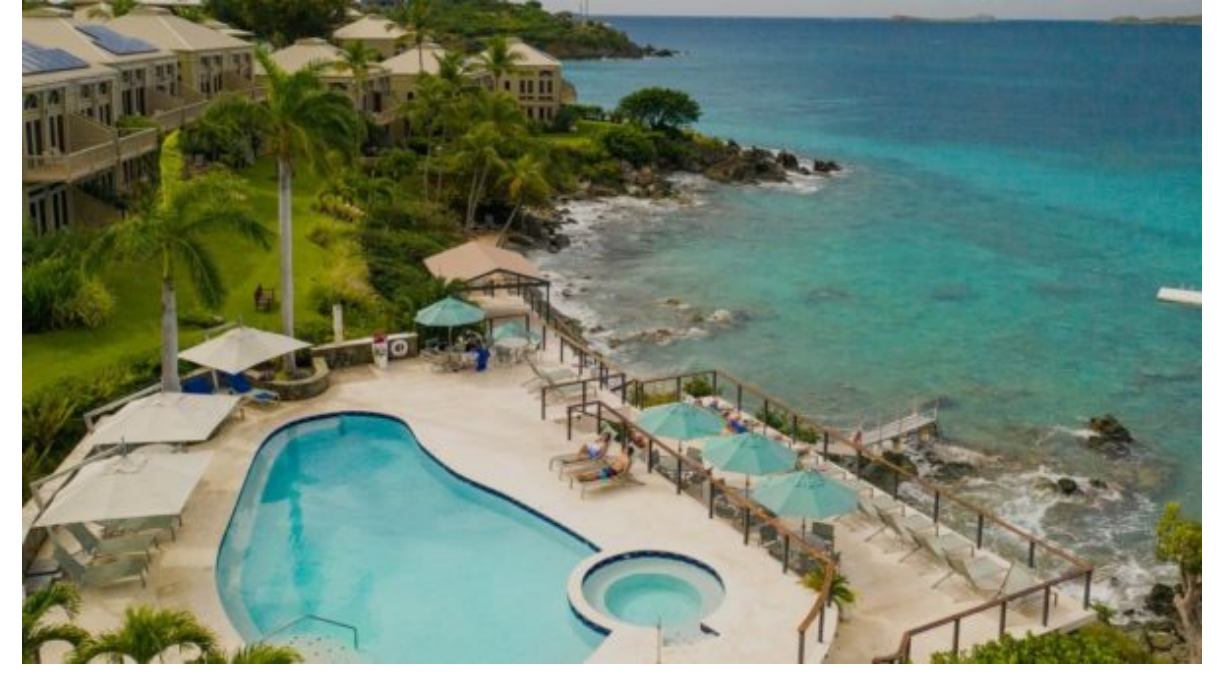
Enjoy all of the amenities and your one-bedroom ocean view villa at Gallows Point!