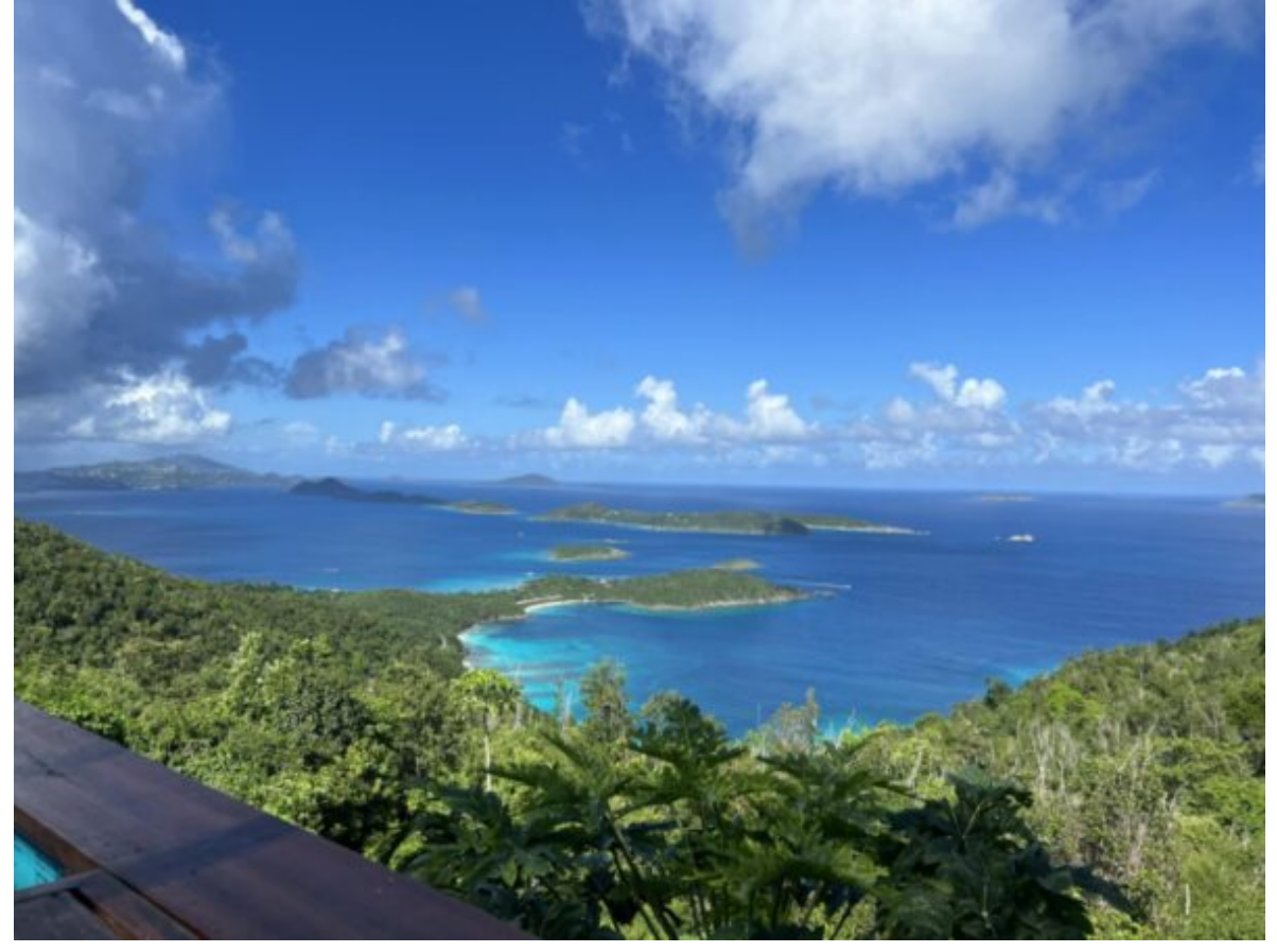
The view from the Windmill Bar NEVER gets old- Especially at sunset!