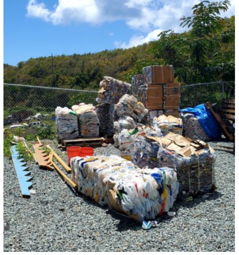
There will be no landfill in the future of these bundles of plastic and aluminum! Thank you Island Green!

Over the past few years, your donations have been imperative to the development and expansion of the following programs: