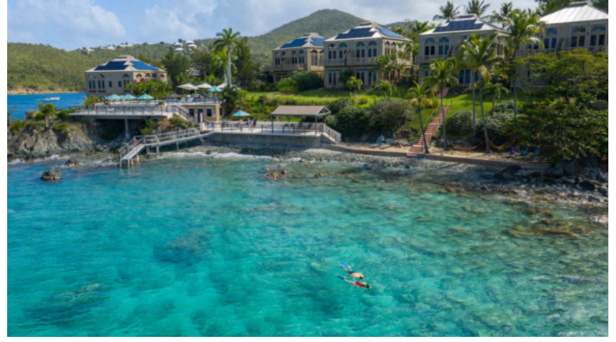
A seven night stay at Gallow's Point Resort is just the beginning of this amazing prize package!