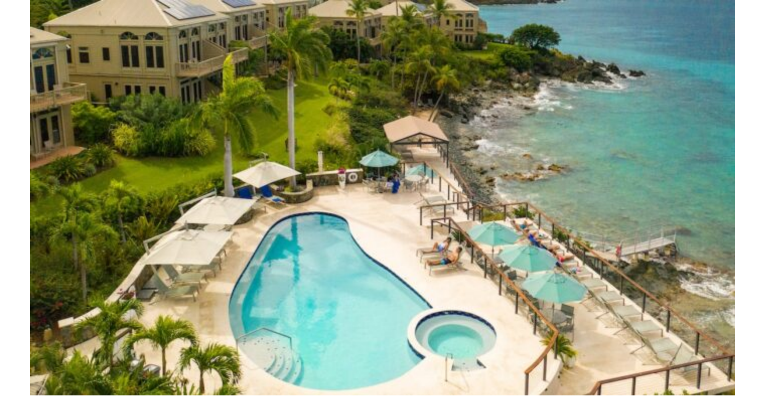
Enter to Win a Trip for 2 to Love City!!!