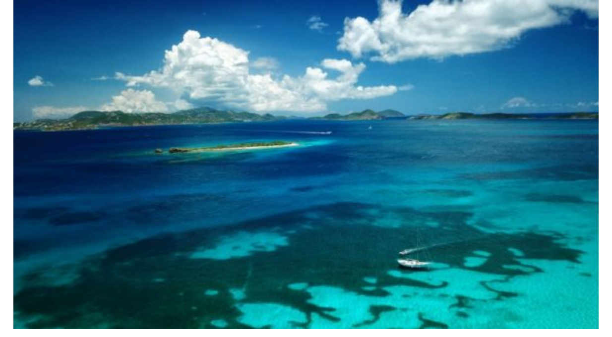
St. John is calling you! Enter to win your next trip today!

If you are having trouble deciding on which direction to go outside of the activities and excursions already planned for you as a part of your prize package, you can just reach out to the on-site concierge at Gallows Point for beach recommendations, dining reservations and other assistance throughout your stay. As a guest at Gallows Point Resort, you'll enjoy direct access to the water from the property with amazing snorkeling within moments stroll from your room. An oceanfront pool, jacuzzi, BBQ area and complimentary parking are just a few of the many amenities available to you at Gallows Point Resort. And all of this amazingness is just steps from the dining and shopping in the heart of Cruz Bay.