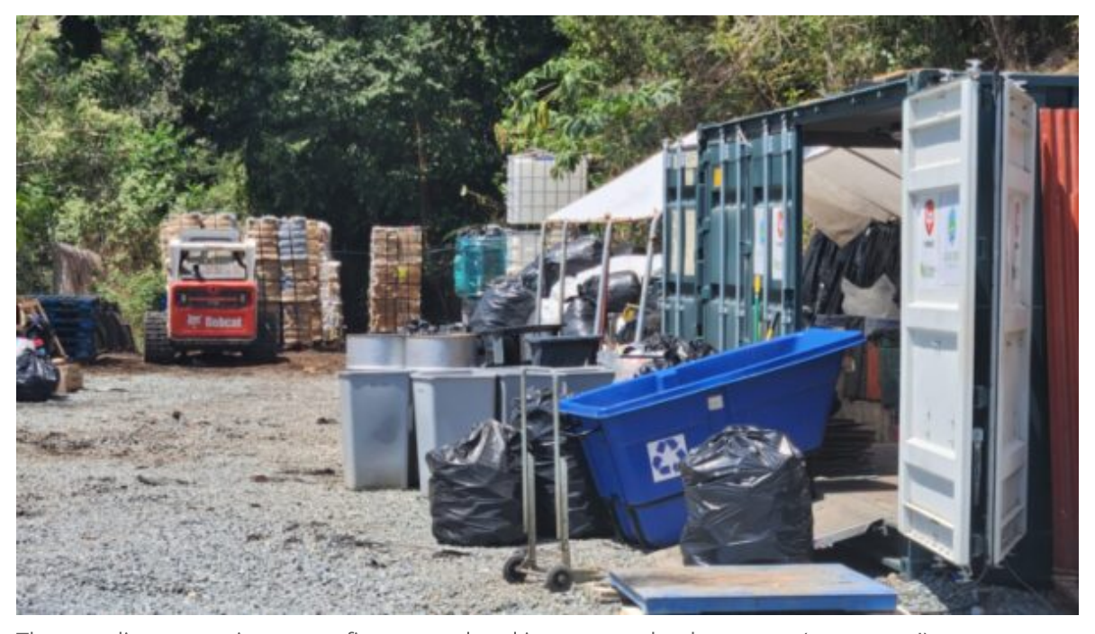
The recycling center is non-profit operated and is run completely on man (or woman!) power.

Over the past few weeks, we have highlighted, not just this incredible prize package, but also the valiant efforts of this non-profit organization that pushes St. John into a more sustainable future each year. We have gone over the non-profit powered recycling program and highlighted Island Green's involvement and background with the USVI's territory-wide sunscreen ban.