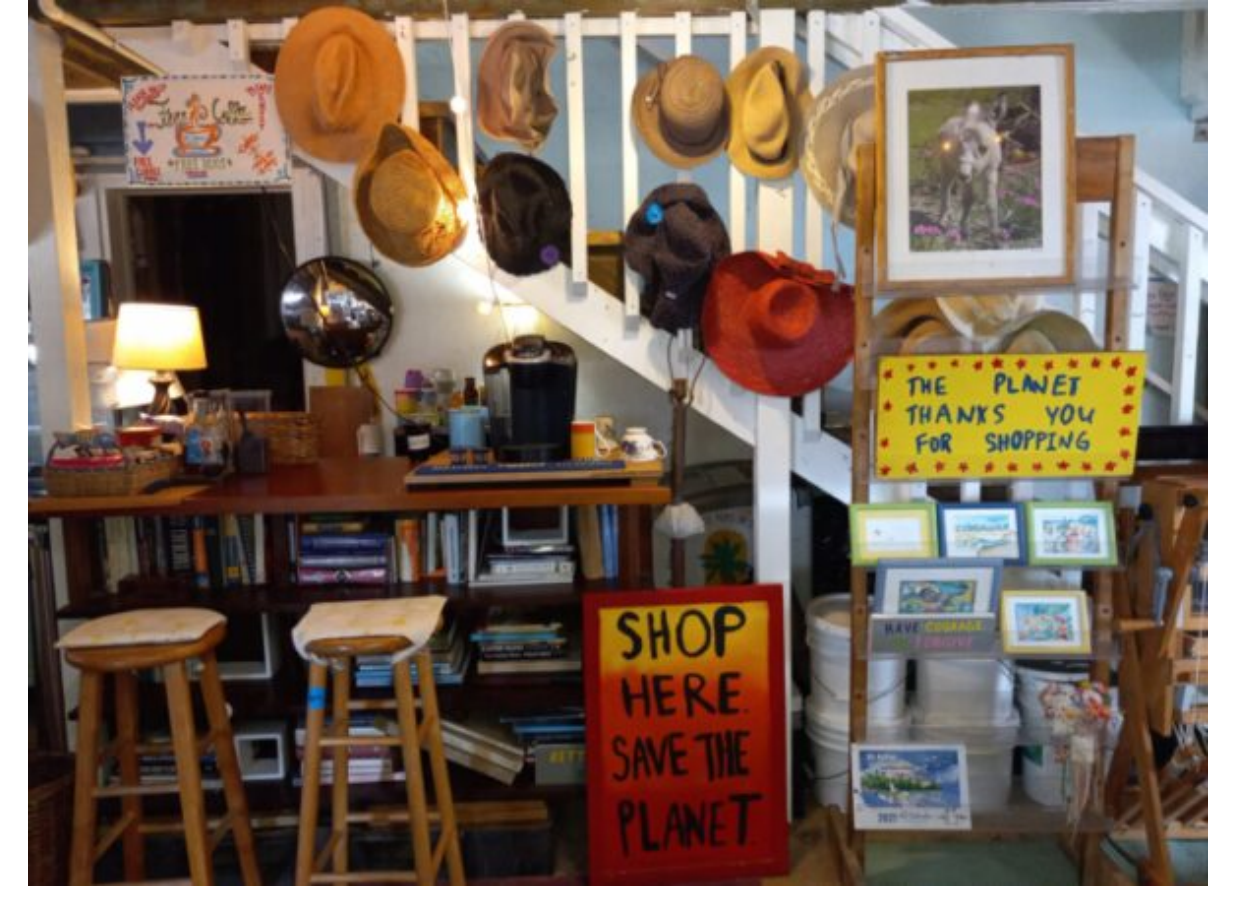
Did I mention there is free coffee while you shop? 🧐

Today, the ReSource Depot on Gifft Hill not only provides people living on island with a place to discard of their gently used housewares, clothing, building materials and furnishings. But it also (and you all know I love this part) fills a void in the community. Hugs and a good laugh are always free at the ReSource Depot. Whether you are stopping by to donate, shop or just say hello. Trust me. I'm there like once a week. \bigcirc