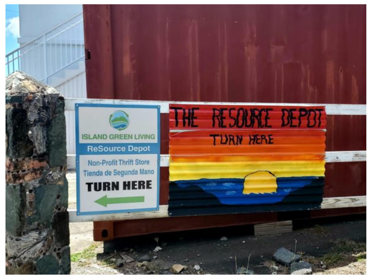
From Centerline, turn onto Gifft Hill Road at Tony's Kitchen and look for the sign immediately on your right.

But today, we dig into my favorite program spearheaded by Island Green Living. A program that provides a space for community involvement and participation (and free hugs!). A space that offers sustainability options, not just on the local level, but one of global impact. A space that has saved so many of us residents a trip to St. Thomas or the awaiting of an Amazon order. A space that has, over time, diverted more than 850 THOUSAND POUNDS of garbage from the St. John and St. Thomas landfills into re-use in the homes of thrifty islanders. Today, we dive deep into the Island Green Living ReSource Depot.