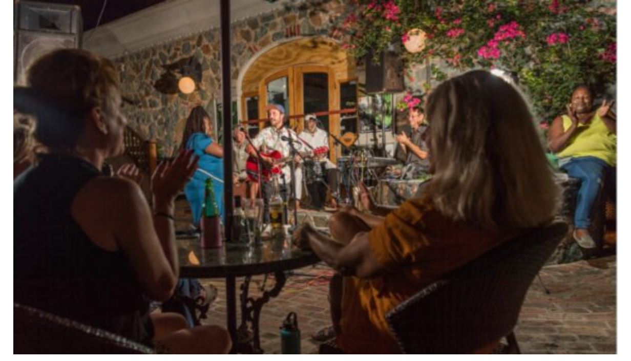
The Wednesday Night Jam at Sun Dog Cafe is a great way to spend an evening!

• $100 at Windmill Bar– What better way to enjoy the sunset than from this perch on the mountaintop offering some of the best views and live music offerings on island. The Windmill Bar staff serves up tasty food and a wide variety of beverages with a smile...l'd be smiling too if this was my office view 😉