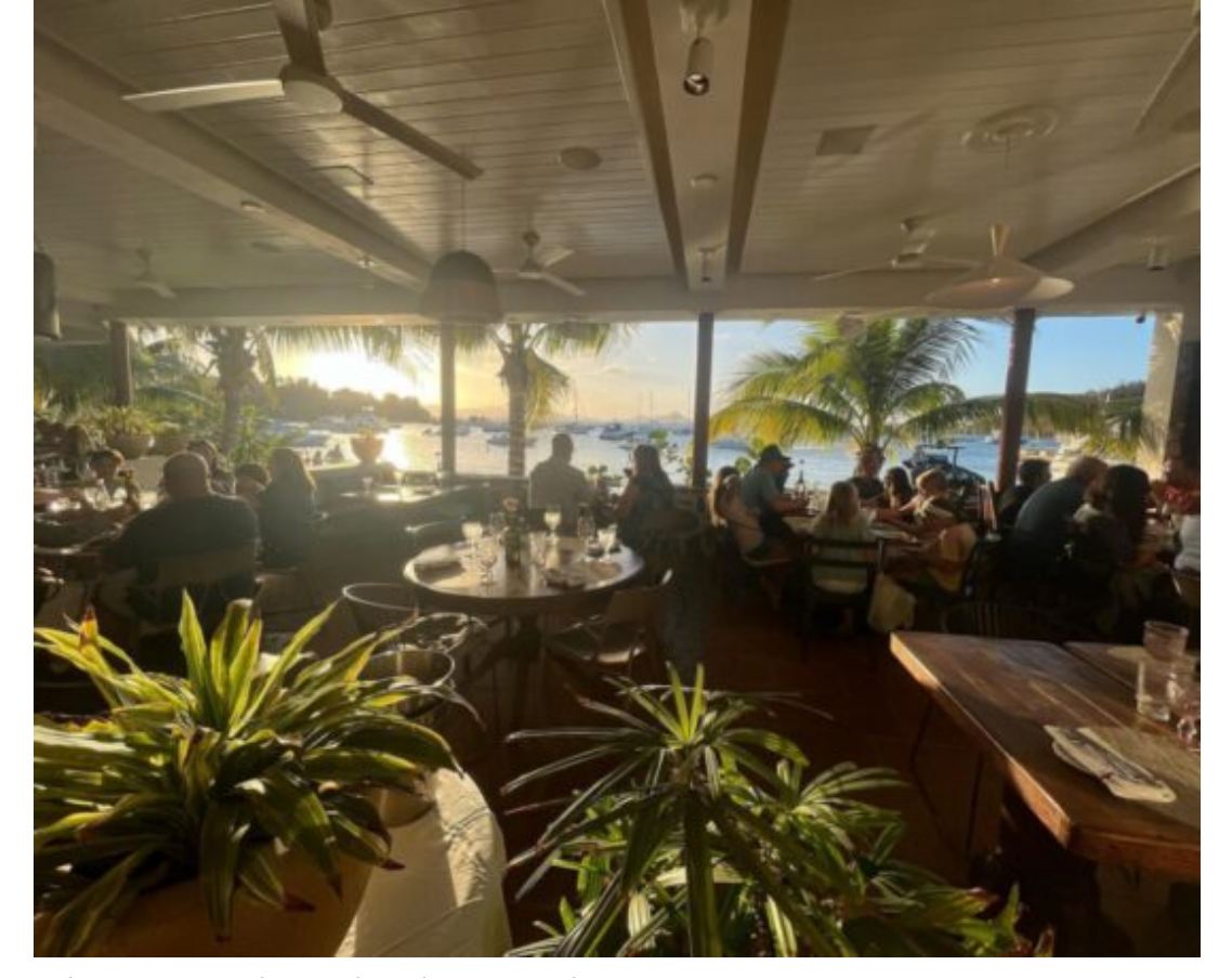
It doesn't get any better than this. Am I right?