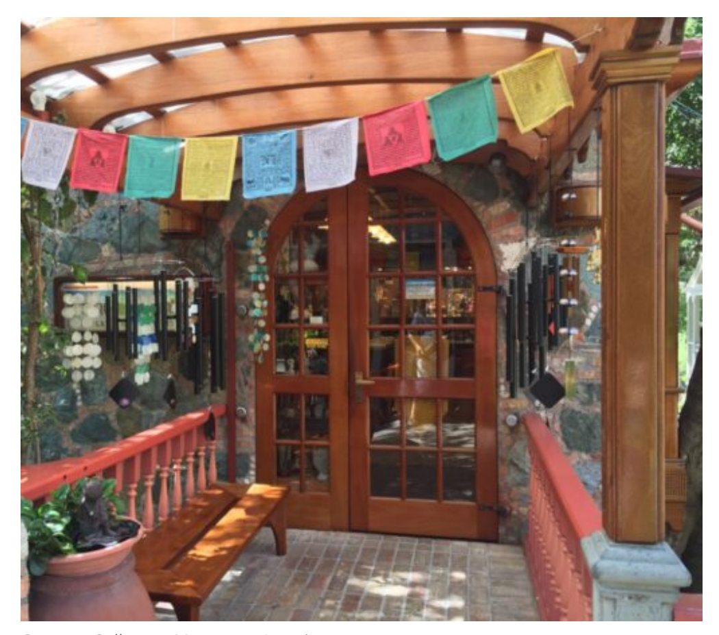
Caravan Gallery at Mongoose Junction

Oh, but wait, there's more...You will also get to do a little shopping at my favorite jewelry store on St. John with $100 to spend at Caravan Gallery; a lovely shop selling jewelry and treasures in Mongoose Junction.