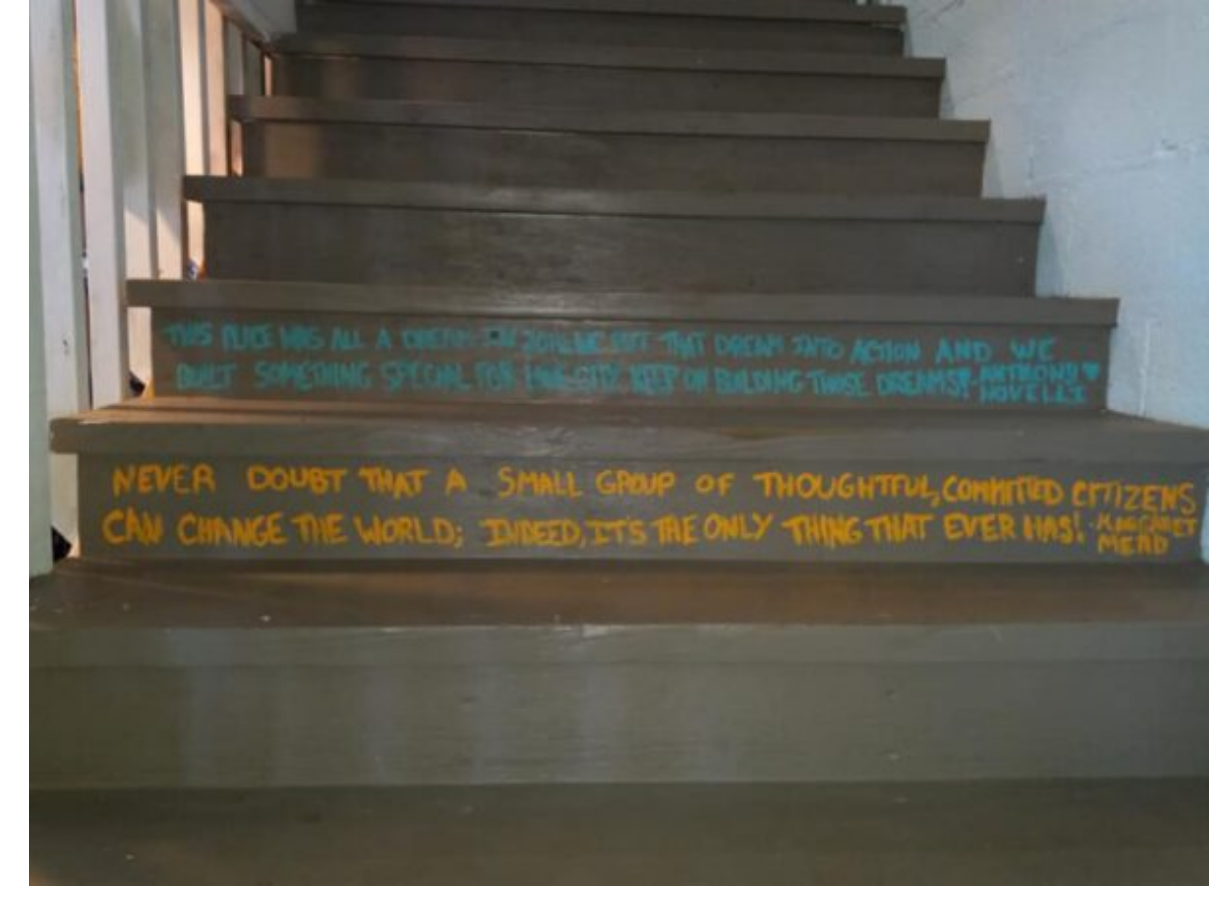
The stairs leading up to the clothing boutique were built with dollars raised at the ReSource Depot. How's that for self-sustainable? 😉

So, the next time you are on St. John and are on the hunt for floats, coolers, snorkel gear, vintage St. John swag or even something nice to wear out on the town, stop by the ReSource Depot to check out the selection, grab a free hug, a laugh or two and some all around feel good stuff. (They are also ALWAYS on the hunt for volunteers! If you can spare an hour of your beach time to help with some donation sorting, pop on by!). Oh, and if you have extra stuff at the end of your visit such as coolers, floats, snorkel gear, water bottles, etc., bring it here instead of leaving it in your accommodations to be thrown away! You can also drop off your recyclables here on your way out. Win, win!