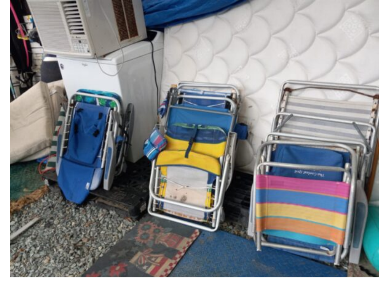
Grab your beach chairs, snorkel gear, Reef Safe Sunscreen and everything you'll need for your vacay- Save the planet and a buck!

Speaking of being out on the town, you'll have plenty of opportunity to do just that as the winner of Island Green Living's Earth Month Fundraiser! In addition to a SEVEN NIGHT stay at Gallows Point Resort, a rental Jeep courtesy of Seashell Vacations, $1000 in airfare from the Department of Tourism and activities provided by Kekoa, Sailing Asante, Lime Out, Salty Daze and Lovango Resort + Beach Club you will also enjoy some of the best dining St. John has to offer. The following dining certificates will be provided by Island Green Living's local partners in this awesome raffle!