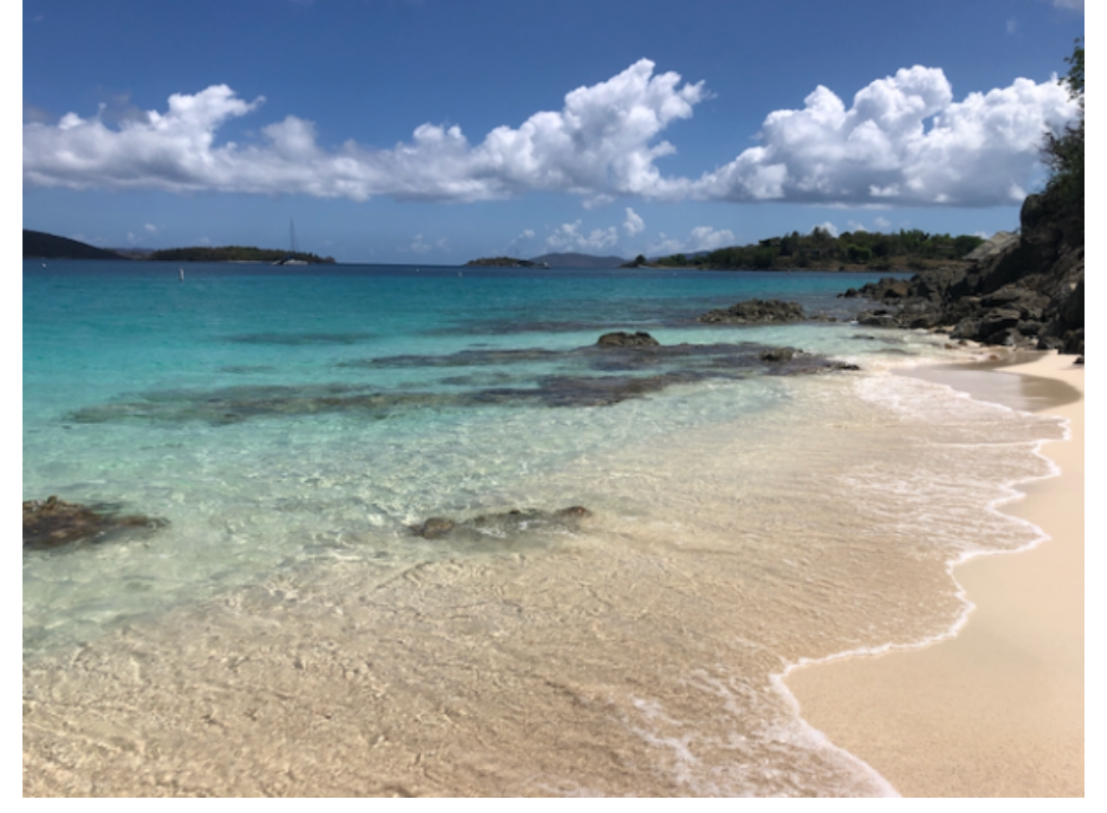
Who is ready to get back here???

Over the past few weeks, we have highlighted, not just this incredible prize package, but also the valiant efforts of this non-profit organization that pushes St. John into a more sustainable future each year. We have gone over the non-profit powered recycling program and highlighted Island Green's involvement and background with the USVI's territory-wide sunscreen ban.