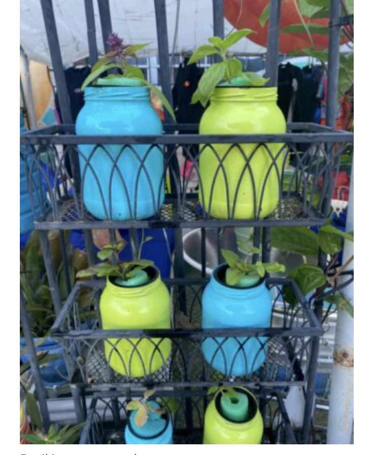
Basil in repurposed pots

Oh, but the ReSource Depot is also SELF-sustainable! Who doesn't love a non-profit program that supports itself? The money raised from the re-sale of items at St. John's only thrift store covers the labor costs and all supply costs for the shop. Last year, a clothing retail area was added to the interior upstairs of the warehouse space. The stairs were built with funds from the sale of items within the store. How cool is that?