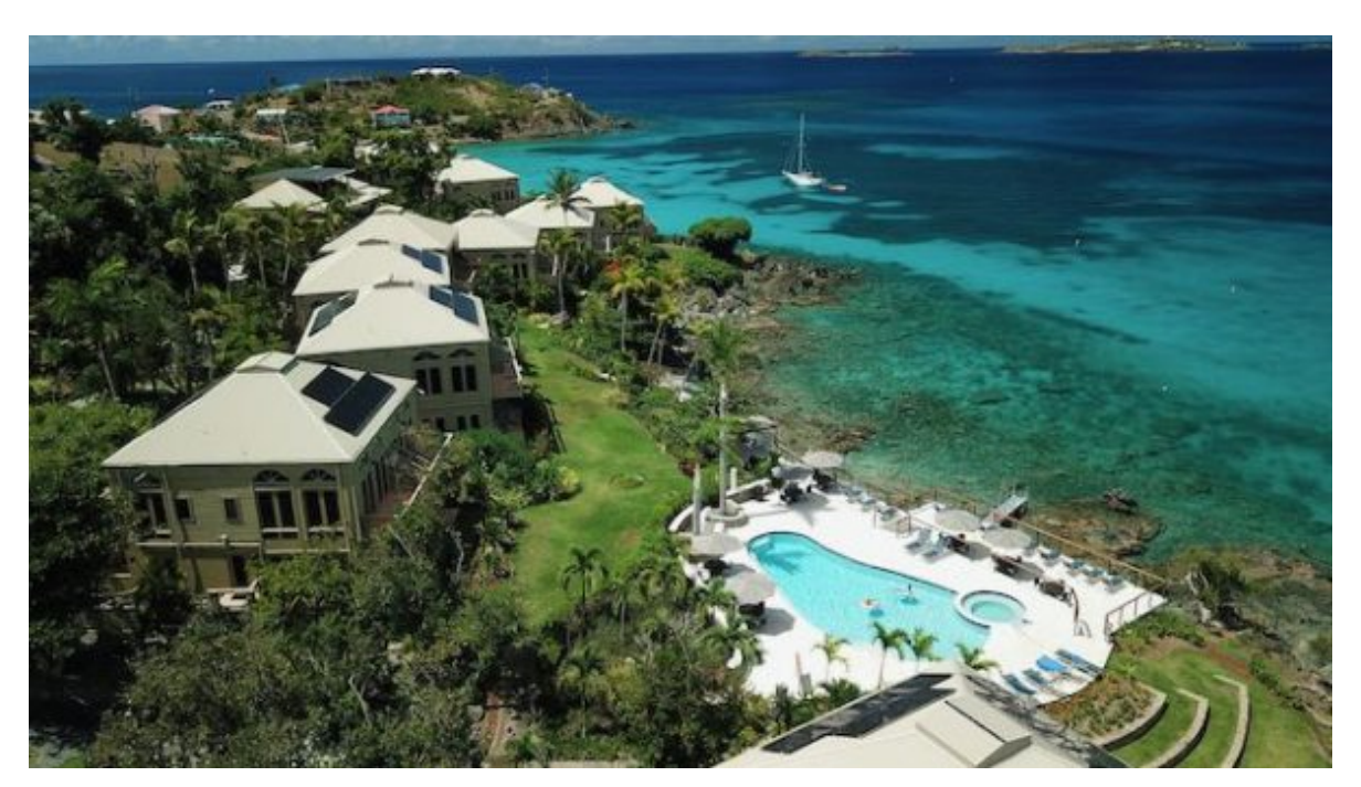
As the winner of this raffle, you and your plus one will spend a magical week at Gallows Point Resort in the heart of Cruz Bay

not only gives you the opportunity to win this trip to St. John but also to support a great community organization that has a visible impact on island.