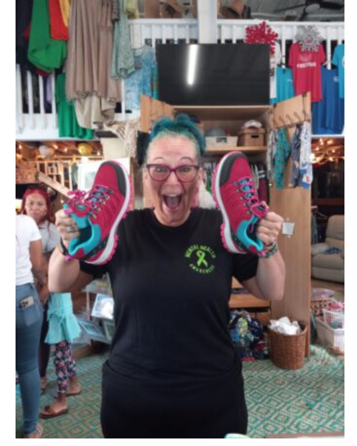
The thrill of the hunt is always exciting...even moreso when you score! \ensuremath{\mathfrak{e}}

Consider this. How many cars have been saved the barge ride to St. Thomas by a quick drop-in to the ReSource Depot? For every resident that saved the trip across the sound, more energy, fuel and environmental contaminants have been spared. Every little bit helps right?