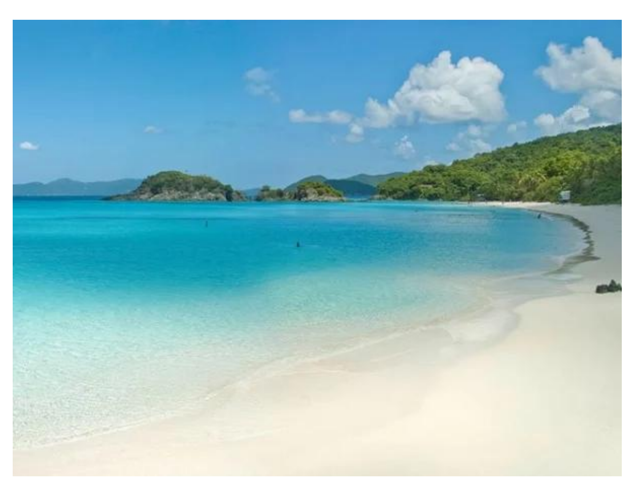
Who is ready for a day (or six!) at the beach?

About that prize package...As the winner of this year's <u>Island Green Earth Month Raffle</u>, you'll enjoy a trip for two to Love City, valued at $11,000, with the following offerings: