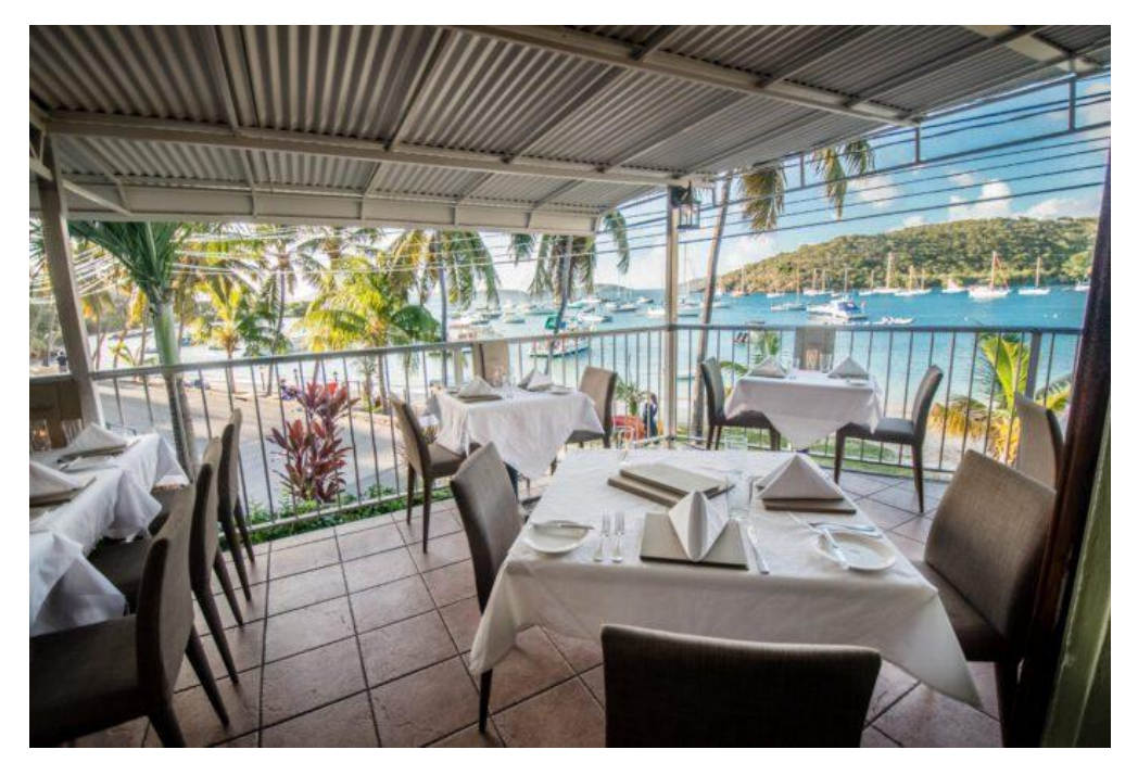
The winner of this raffle will enjoy incredible dining as a part of the prize package, including an evening of oceanfront deliciousness at The Terrace!